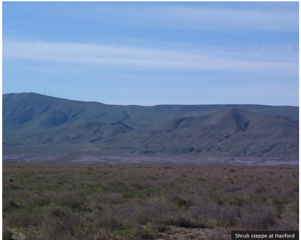
Shrub steppe at Hanford

The HNRTC, formed in 1996, is a collaborative working group authorized under CERCLA and chartered to address